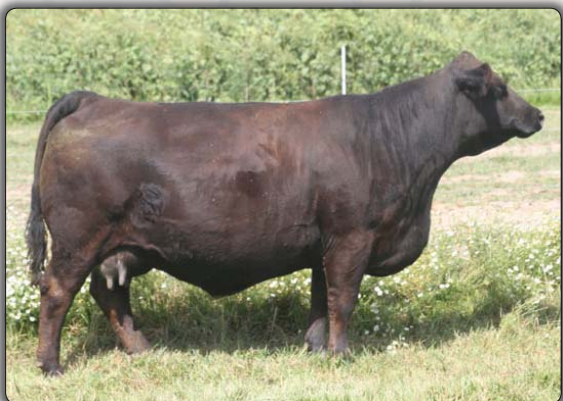
SAS LICORICE S532 Dam of Lots 33, 34, 36 and 37

• We don't creep feed, so don't penalize these brothers for having a recip mother that does not have years of selection pressure placed on her to improve her production. These guys have all exploded after weaning and continue to develop into fantastic herdsire prospects. They are big hiped with far above average rib shape. Sons of the Licorice cow have outproduced themselves everywhere they have been used. They will all be female makers and offer excellent growth.