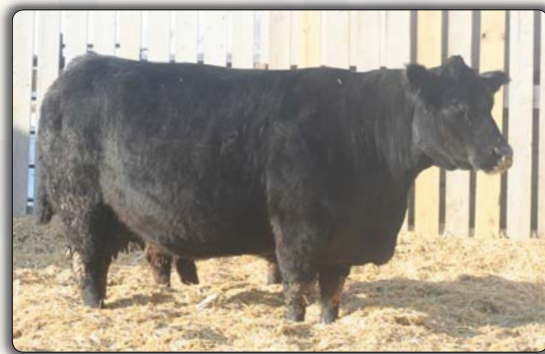
SAS T036 SERENA Donor dam of Lots 14 and 15