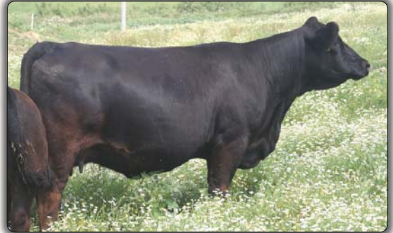
SAS DENISE C511 Dam of Lot 7