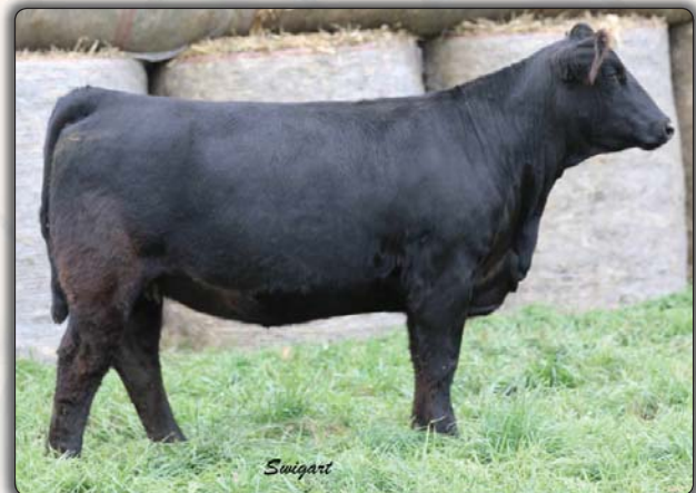
BAR QH 304 Full sibling to Lot 52