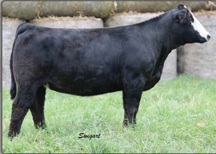
BAR QH 319 Full sibling to Lot 16