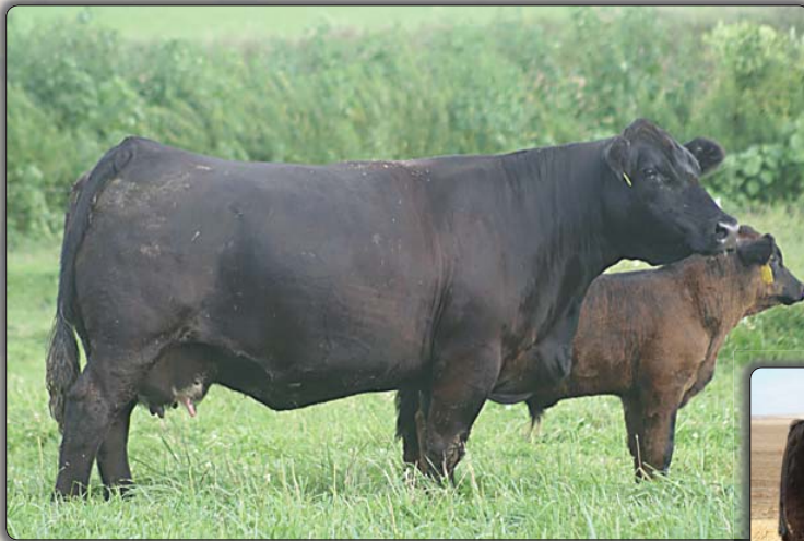
SAS SWEET STAR R101 Donor dam of Lot 115 embryos