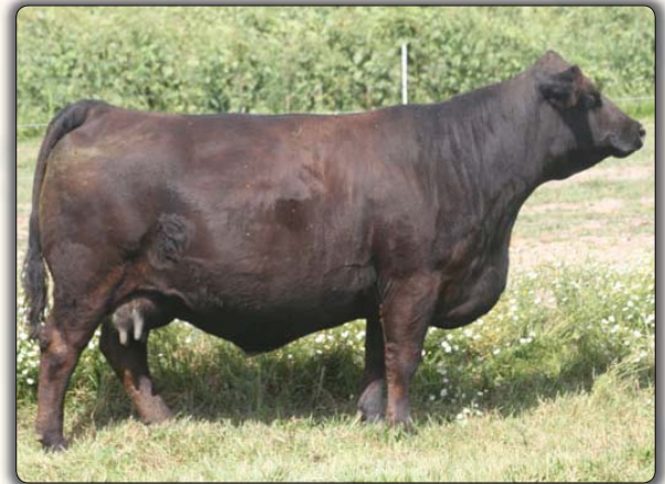
SAS LICORICE Dam of Lots 1 and 2

Lot 1 SAS BITTEN E532 Reg #3313620 Tattoo: E532 BD: 1/5/2017 Black - Polled