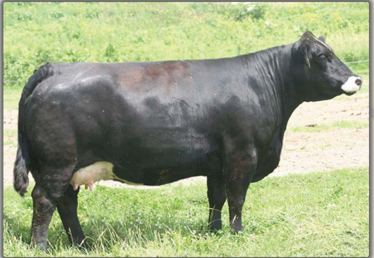
SAS SUGAR X207 Grandam of Lot 29