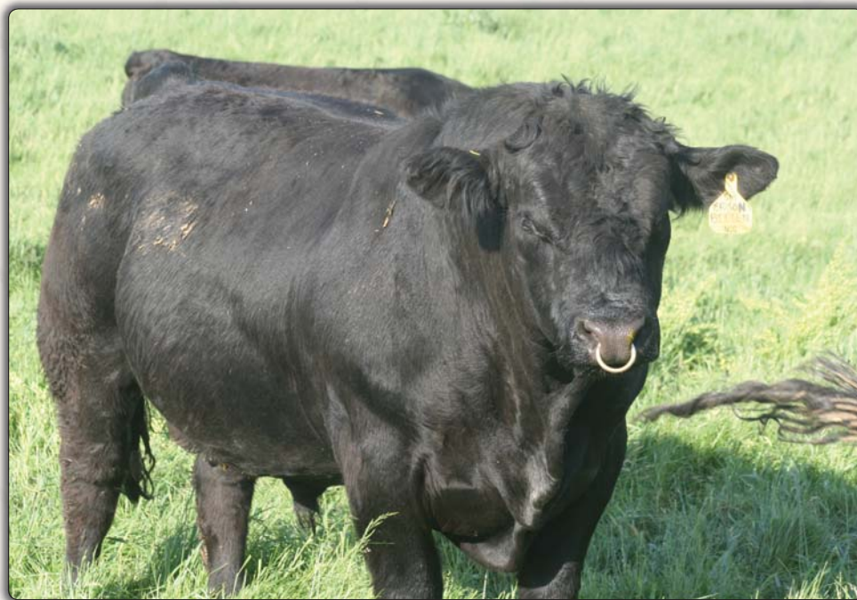
ERIXON BITTEN 203A