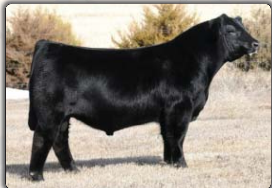
W/C RELENTLESS 32C Sire of Lot 109 embryos