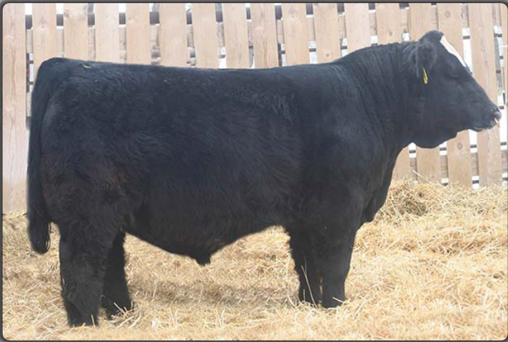
SAS RENOWNED A733 ASA #: 2826217