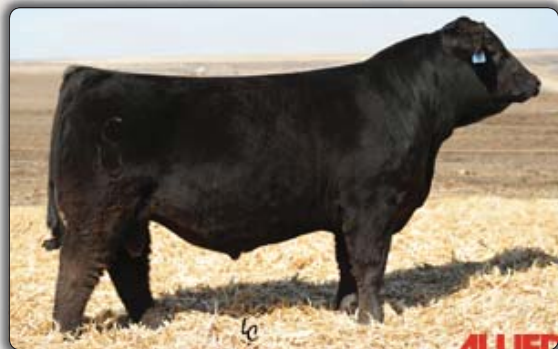
CCR COWBOY CUT 5048Z Sire of Lots 14 and 15