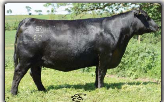
RB LADY W W 308-988 Dam of Lot 12