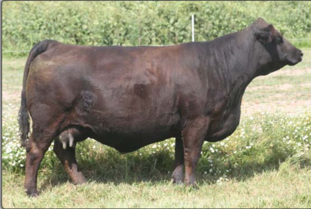
SAS LICORICE S532 Donor dam of Lot 108 and 109 embryos