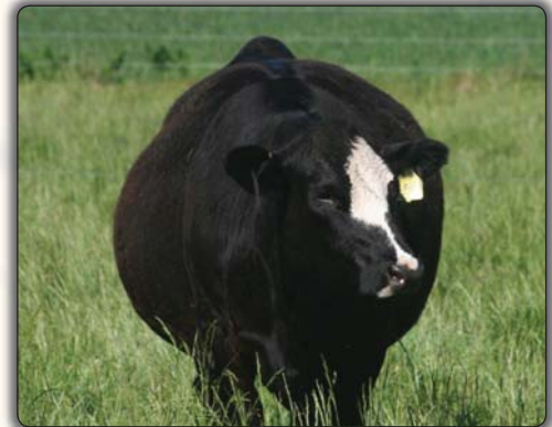
SAS MISS ARAPAHOE Y502 Dam of Lot 10

Lot 11 SAS BITTEN E502 Reg #3313543 Tattoo: E502 BD: 1/16/2017 Black - Polled