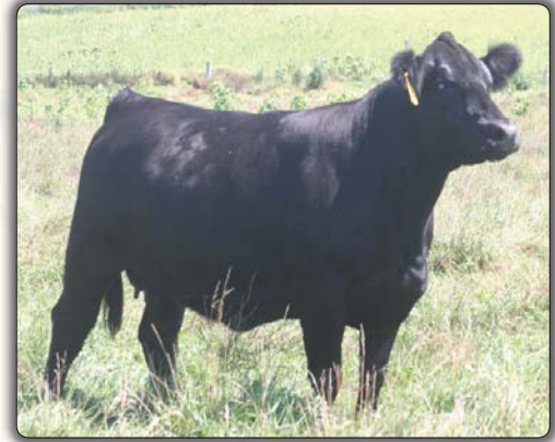
SAS STAR B552 Dam of Lot 9