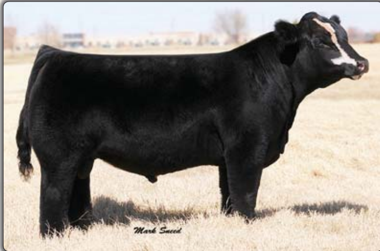
WS A STEP UP X27