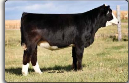
DAUGHTERS OF X207