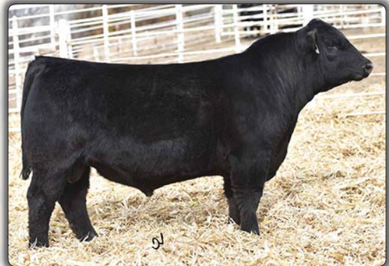
TJ MAIN EVENT 503B Sire of Lot 108 embryos