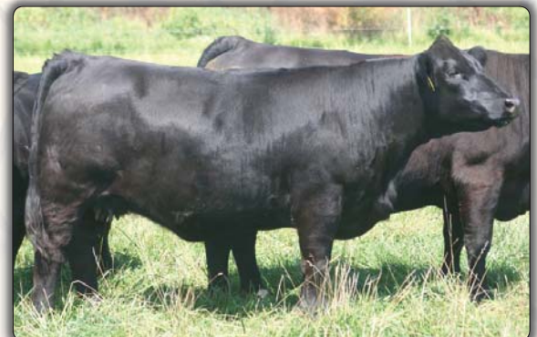
SAS BARBIE B208 Dam of Lot 10