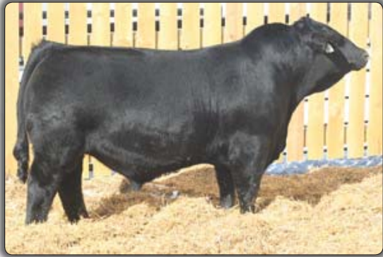
SAS BIG BRUZER Y131 Maternal grandsire of Lot 42

• Individual Performance: BW 75 lbs, BWR 103, WW 812 lbs, WWR 100, Adj. YW 1239 lbs.