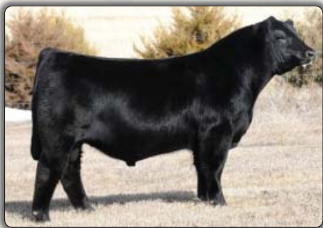
W/C RELENTLESS 32C Sire of Lot 110 embryos