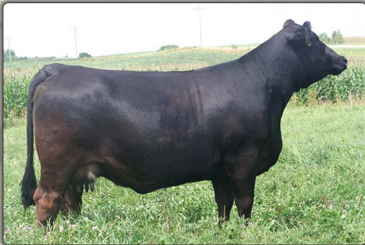
SAS ANGEL Z101 Donor dam of Lot 110-112 embryos