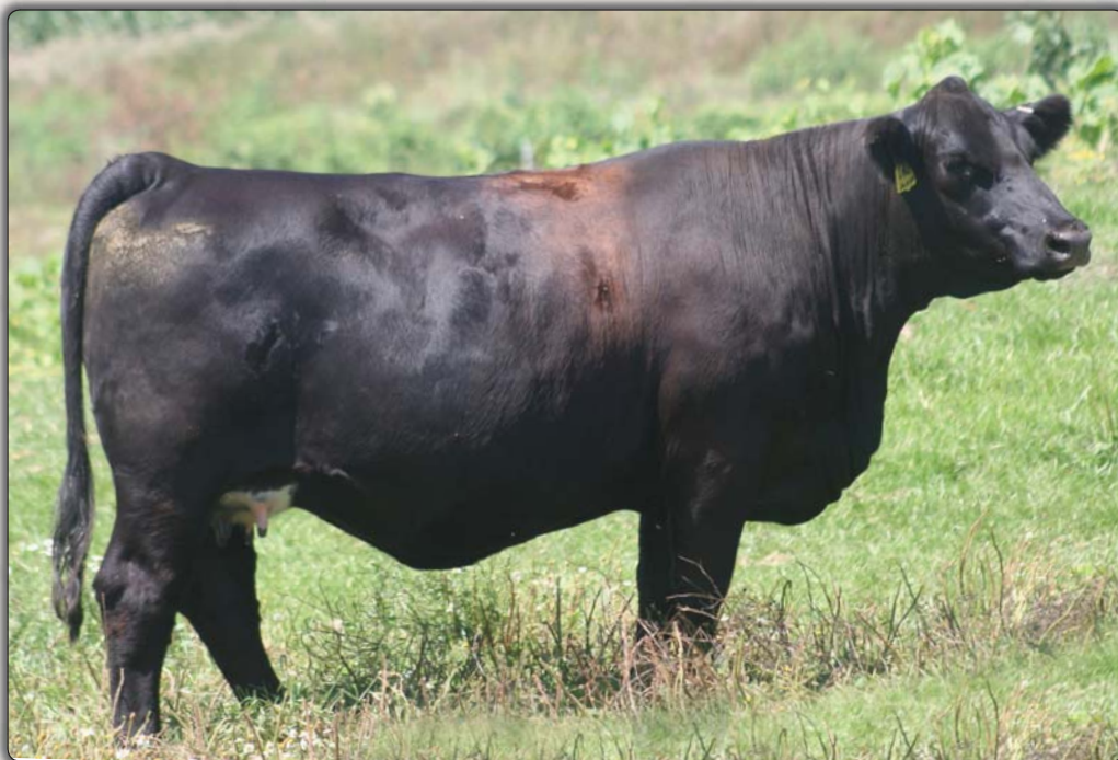
SAS LICORICE B092 Donor dam of Lot 113 and 114 embryos