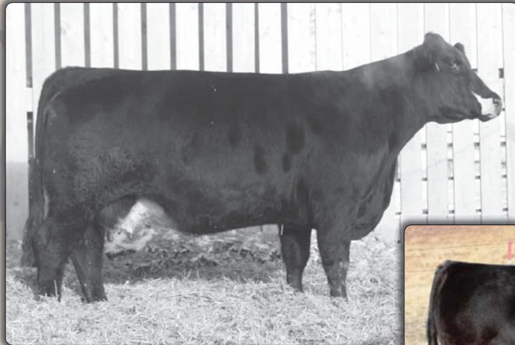
SAS SUGAR Donor dam of Lot 106 embryos