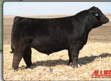
CCR COWBOY CUT 5048Z Sire of Lot 115 embryos