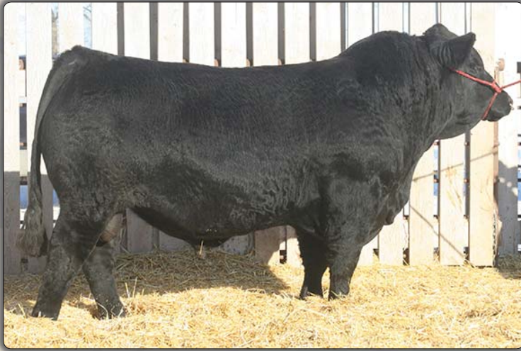
SAS YUKON B036 Service sire of Lots 95, 96, 100 and 101