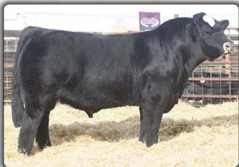
SAS RENOWNED A733 Sire of Lot 112 embryos