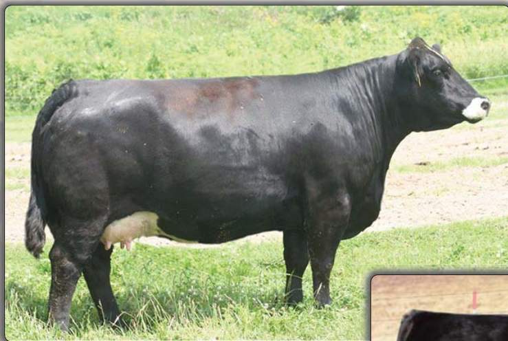
SAS SUGAR X207 Donor dam of Lot 107 embryos