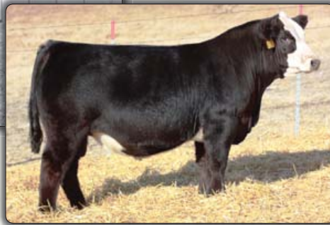
W/C LOCK DOWN 206Z Sire of Lot 106 embryos