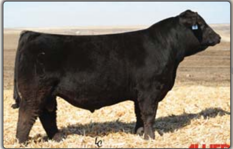
CCR COYBOY CUT 5048Z Sire of Lots 40 and 41