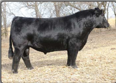
TJ HIGH CALIBRE Sire of Lot 111 embryos