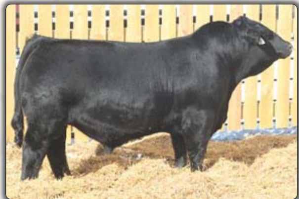
SAS BIG BRUZER Y131

• Individual Performance: BW 81 lbs, WW 740 lbs, Adj. YW 1336 lbs.