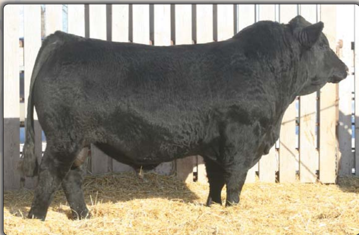
SAS YUKON B036