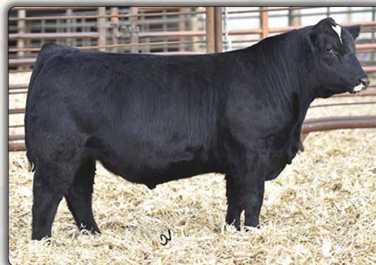
HOOK'S BROADWAY Sire of Lot 114 embryos